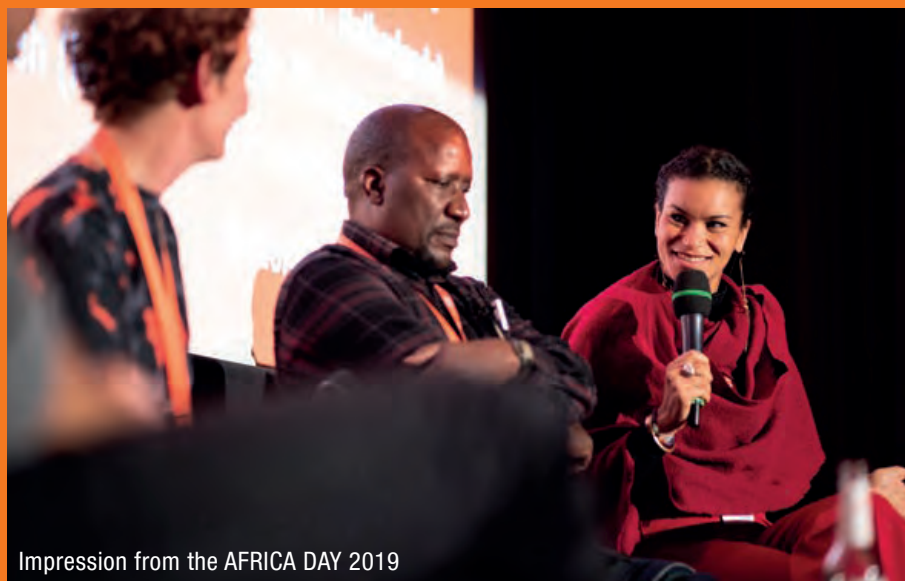
Impression from the AFRICA DAY 2019